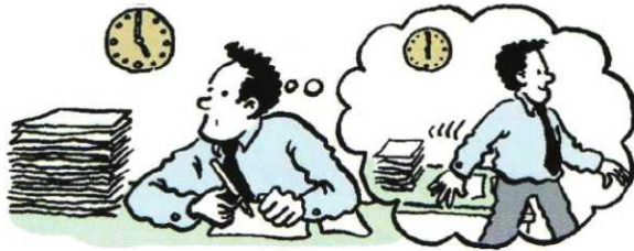
It's now five o'clock. I will stop work at six.

2. We make sentences with will like this: