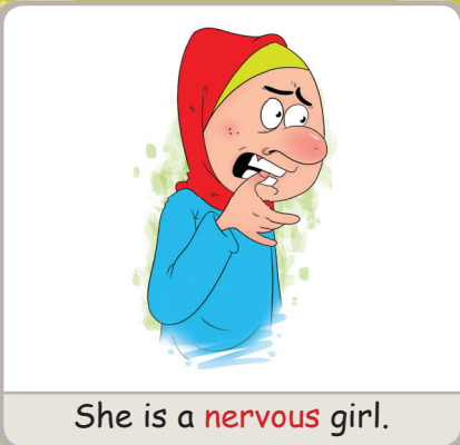
She is a nervous girl.