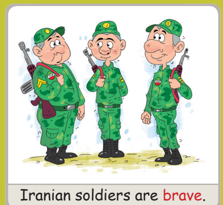
Iranian soldiers are brave .