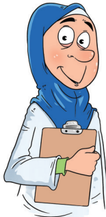
She is a helpful nurse.