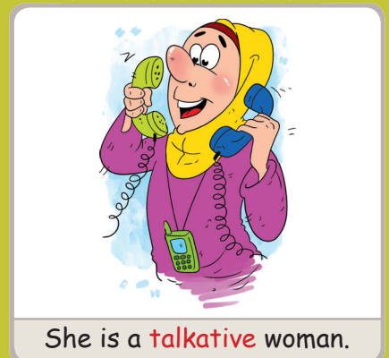
She is a talkative woman.