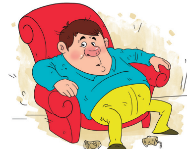
He is a lazy person.