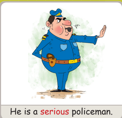
He is a serious policeman.