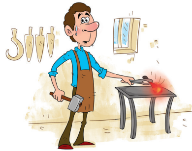
I am hard-working .