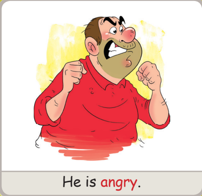
He is angry .