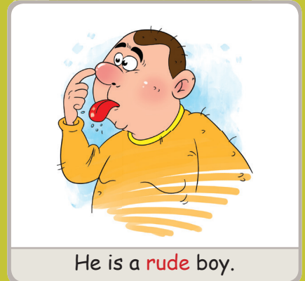
He is a rude boy.