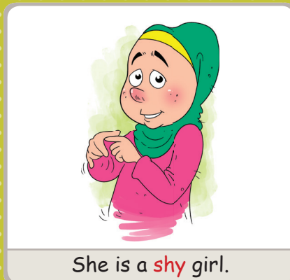
She is a shy girl.