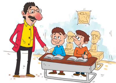
He is a kind teacher.