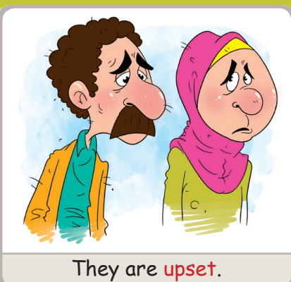
They are upset .