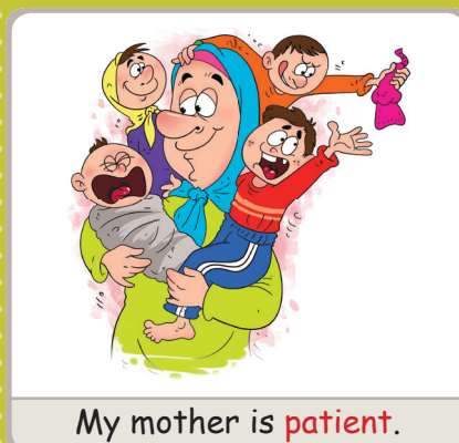
My mother is patient .