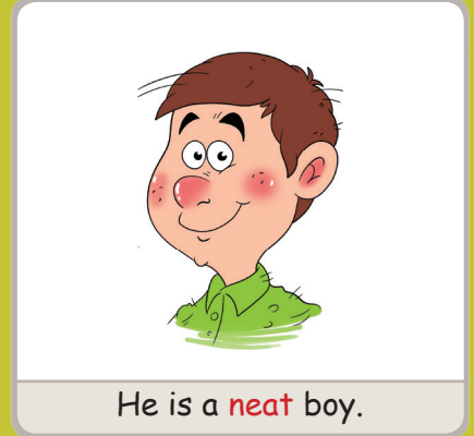
He is a neat boy.