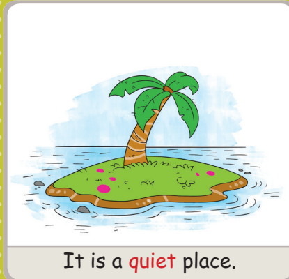
It is a quiet place.