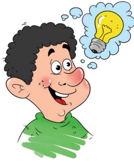
He is clever .